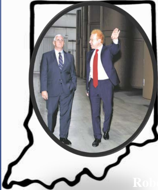
Robert Mann Packaging Acquisition