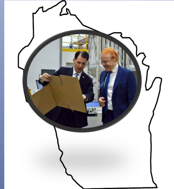
Minnesota Corrugated Box Acquisition