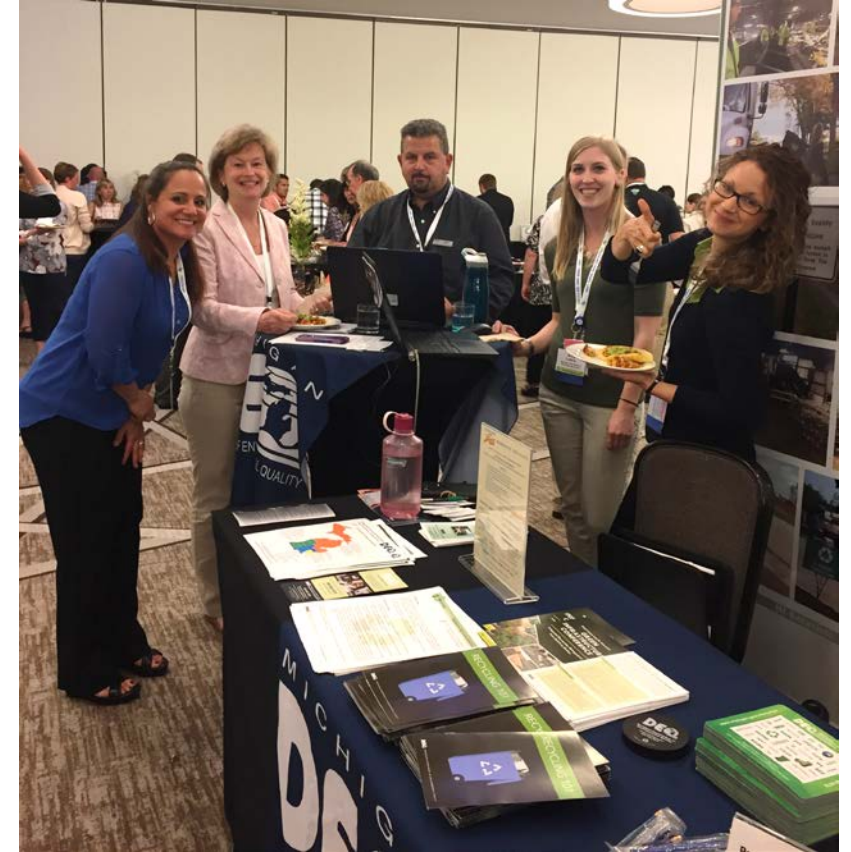
Recycling Reporting Booth at MRC Conference, 2017