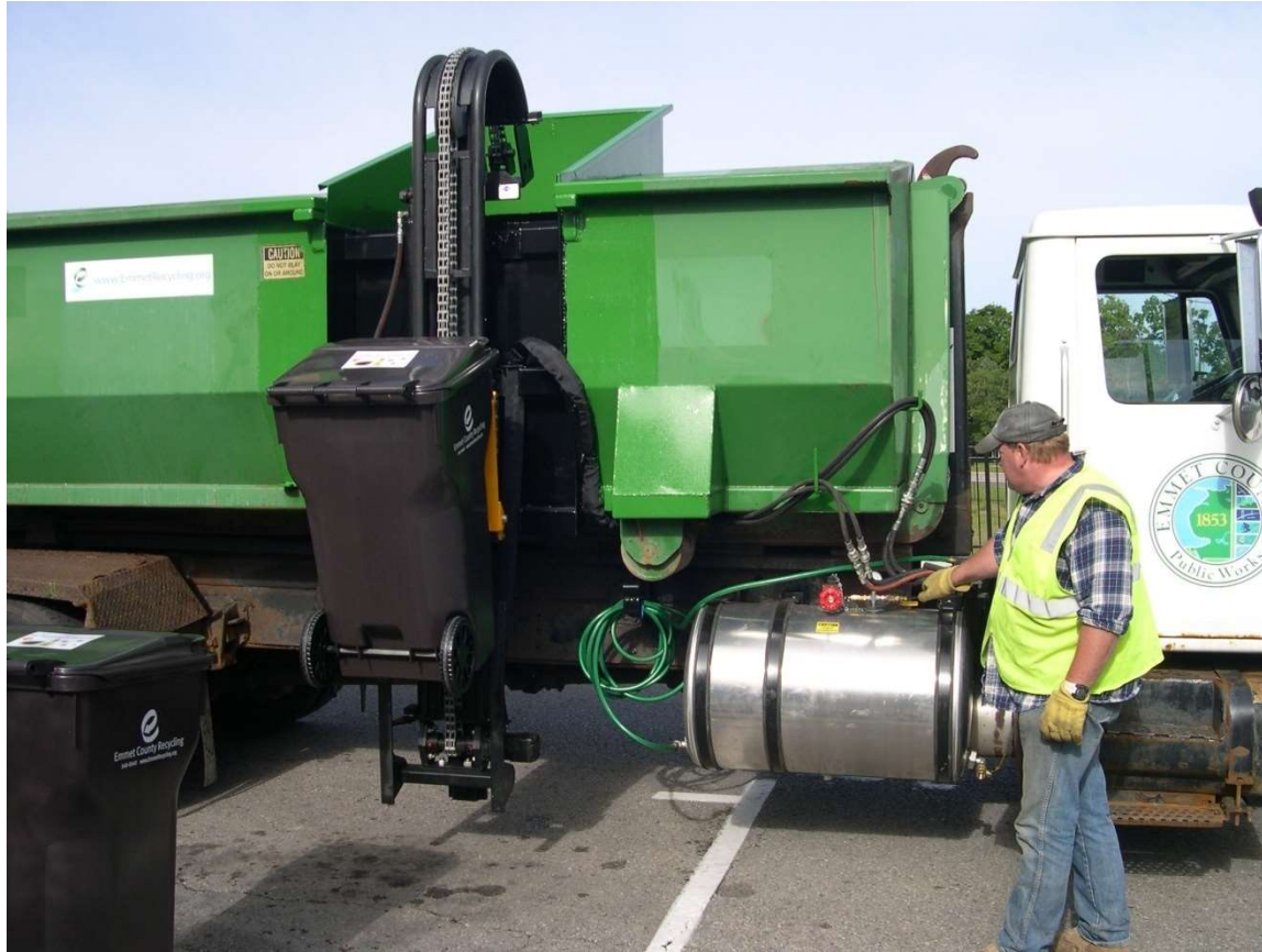
Modified 30 yd Drop-site Bin, repurposed Hook-lift truck with Perkins Cane Lift and on-board pressure washer